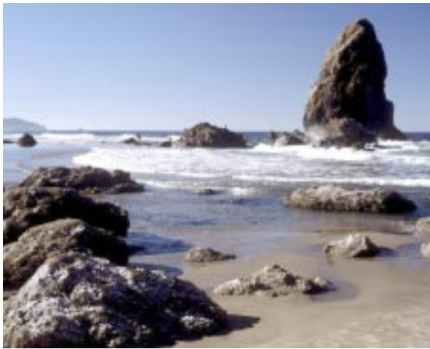
Rocky beaches may be composed of large boulders, medium-sized rocks, or small gravel-sized particles.

Rocky beaches may be composed of large boulders, medium-sized rocks, small gravel-sized particles, or even smaller-sized granules. The beaches on the West Coast of the United States are much rockier than the beaches along the Florida coast. A famous rocky beach is Pebble Beach in California. At Pebble Beach you can see egg-sized smooth rocks that have been carried down from the mountains by fast-moving waters. When you